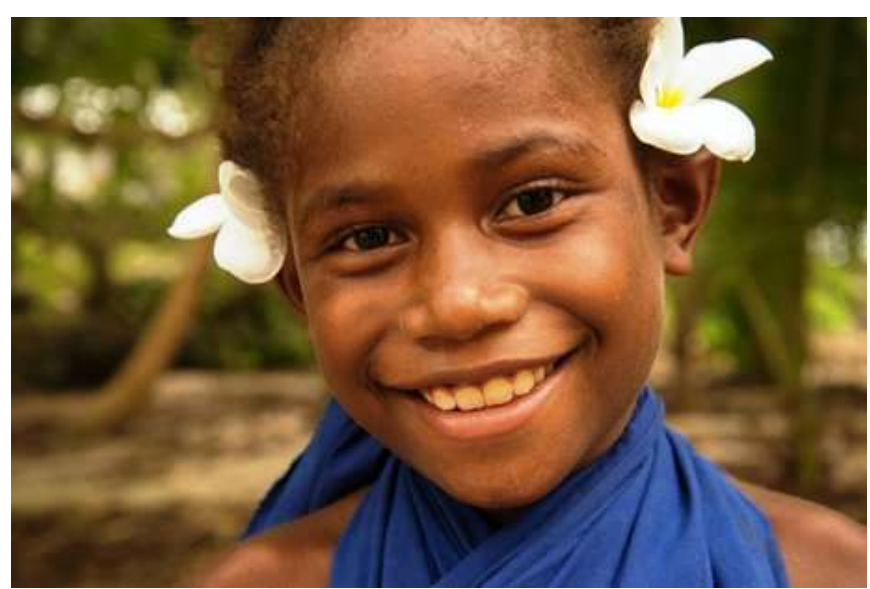
One of the many beautiful local girls.