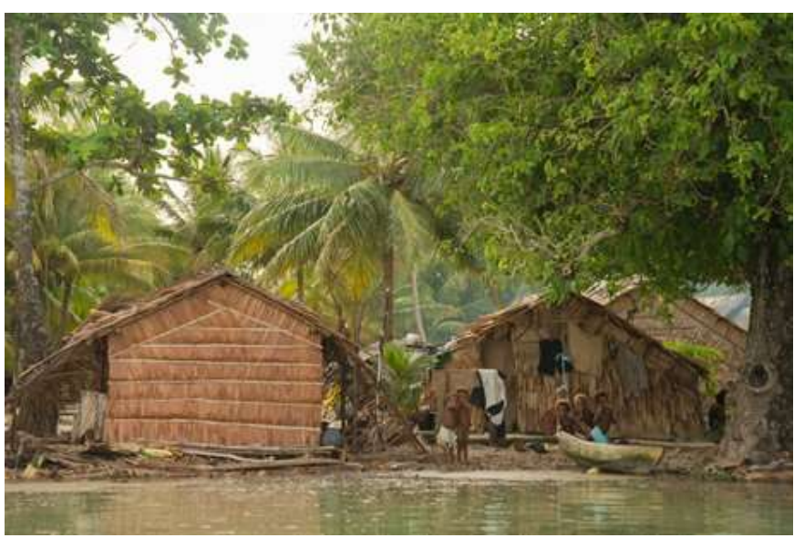
Ngadeli with homes so close to the high tide level, showing how vulnerable they are to rising sea levels.