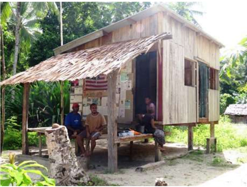
The solar panelled charge and resource centre that we built with them in 2013 was working well.