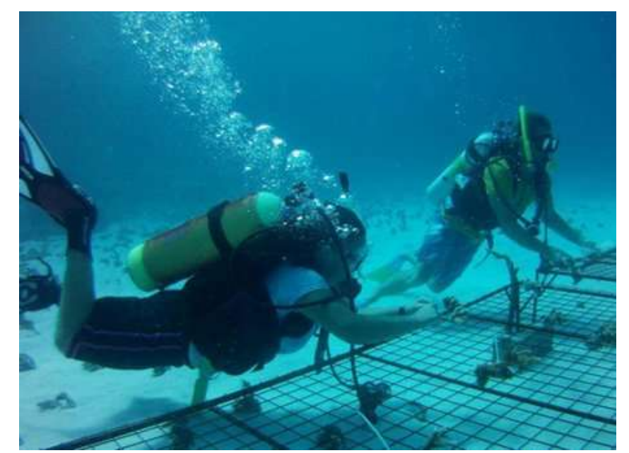
Coral gardening project in Vanuatu.