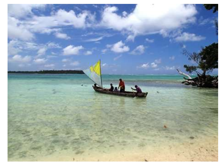
Sailing canoe in the Reef Islands