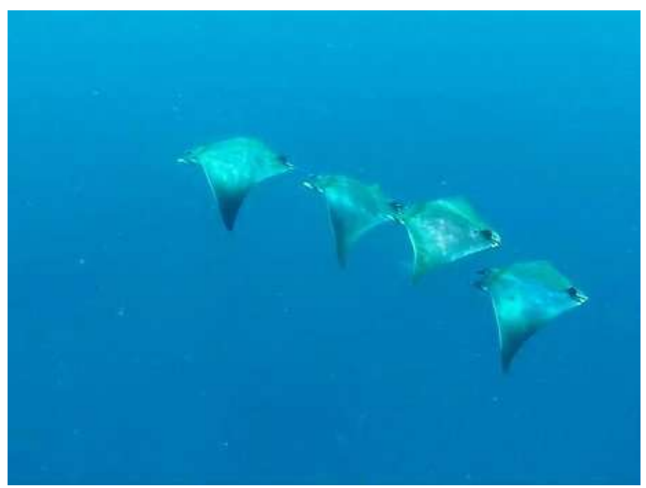
Manta rays in the Reef Islands during their mating ritual.